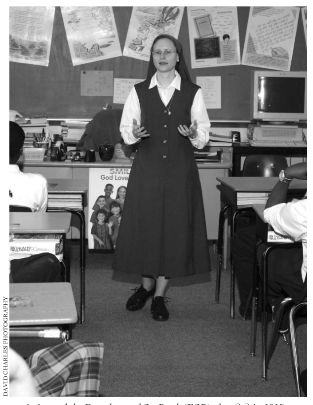
A sister of the Daughters of St. Paul (FSP), founded in 1915, in Alba, Italy; an order dedicated to evangelizing the world with the full message of Christ through all the modern means of social communication

This Creed is not only a summation of what we believe but also "the Rule of Faith" as called by St. Augustine, who was another early bishop of the Church from North Africa. He was bishop in Hippo for nearly 35 years (AD 395-430). He teaches us that the doctrines contained in the Creed are scattered throughout the Bible. They are brought to-