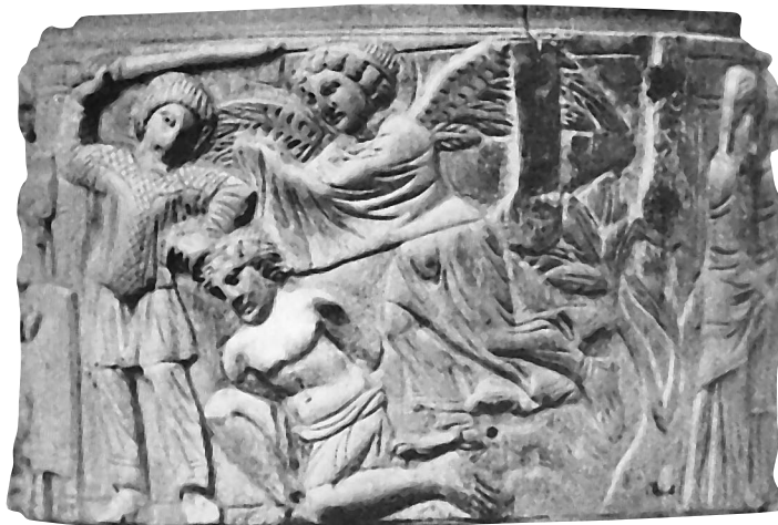
Martyrdom of St. Menas, 6th century ivory carving from Alexandria, Egypt

If he wished, God could eliminate all evil. He would accomplish this, however, only by removing free will from us. Without free will, though, we would no longer be truly human. We would no longer be kind or generous or thoughtful. We would no longer love, for love requires freedom. Due to our fallen nature and tendency to sin, evil will exist until the end of time, as Jesus tells us: "The Kingdom of Heaven may be compared to a man who sowed good seed in his field; but while men were sleeping, his enemy came and sowed weeds among the wheat, and went away. So when the plants came up and bore grain, then the weeds appeared also. And the servants of the householder came and said to him, 'Sir, did you not sow good seed in your field? How then has it weeds?' He said to them, 'An enemy has done this.' The servants said to him, 'Then do you want us to go and gather them?' But he said, 'No; lest in