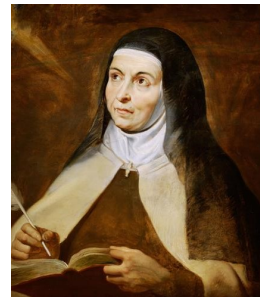
Saint Teresa of Ávila

Understanding our Catholic faith is good and necessary but applying our knowledge in service to others is what we are called to do. “If you know these things, you shall be blessed if you do them.” (John 13:17). The central focus during each