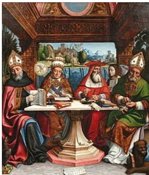
Saints Augustine, Gregory the Great, Jerome and Ambrose (left to right)