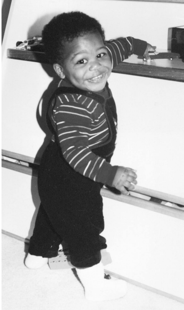
A child is always a blessing

artificial interference with conception is acceptable because, so it is supposed, human beings are mere biological beings. Yet Sacred Scripture teaches us that our bodies, like our souls, are holy to God: “Shun immorality. Every other sin which a man commits is outside the body; but the immoral man sins against his own body. Do you not know that your body is a temple of the Holy Spirit within you, which you have from God? You are not your own; you were bought with a price. So glorify God in your body” (1 Cor 6:18-20).