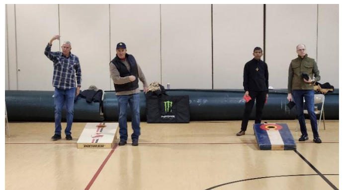
Knights and our priests playing cornhole at the February social meeting