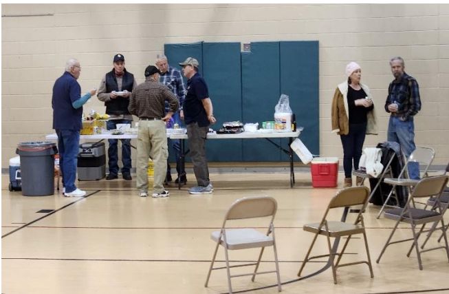
Knights and their wives at the February social meeting