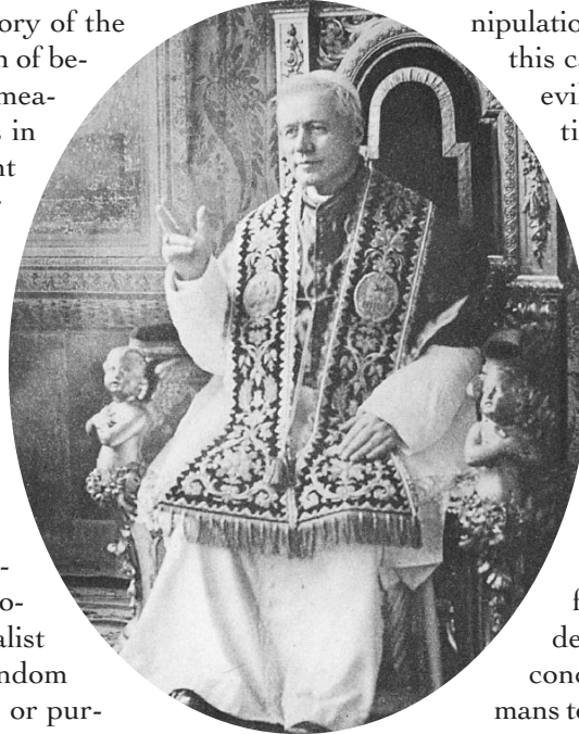
Pope St. Pius X, reigning from 1905 to 1914, sought to combat the rapidly spreading errors and excesses of the secular mindset

Those who have no solid basis for their "values" fall prey to one of the most devastating errors of our contemporary culture: the belief that the purpose of an action can alone make it good. In older terminology, this was called the belief that the "end justifies the means." All the evils of abortion and ma-