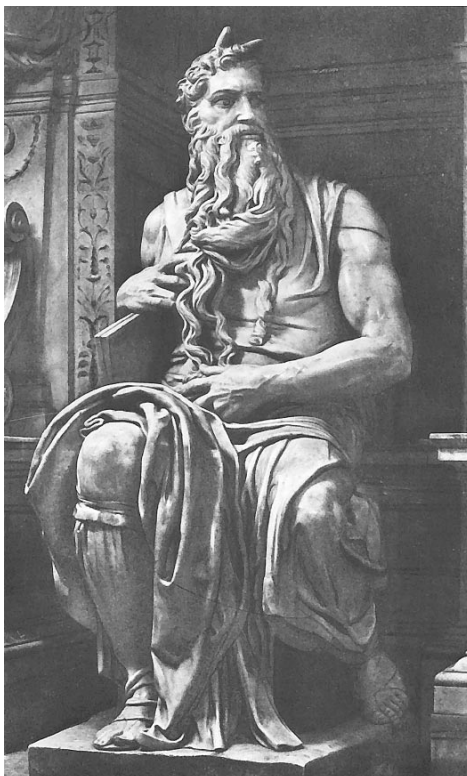
Statue of Moses, by Michelangelo Buonarroti, 1475-1564

The book of Exodus opens with the initial prosperity of the Israelites in Egypt and their later enslavement. Yet “the more they were oppressed, the more they multiplied” (Ex 1:12). Eventually this led the Pharaoh (the ruler of Egypt) to order the murder of every boy at birth (see Ex 1:15-22). It was to this generation of children that Moses was born, and saved through the ingenuity of his mother and sister and the pity of one of Pharaoh’s daughters (see Ex 2:1-10). Grown to manhood, Moses murdered an overseer who was beating a Hebrew slave, and