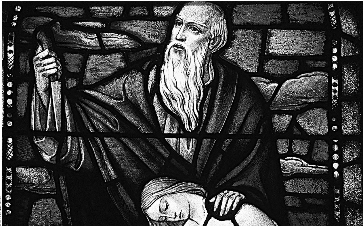
Abraham willing to sacrifice his son Isaac

bless you, and make your name great, so that you will be a blessing. I will bless those who bless you, and him who curses you I will curse; and by you all the families of the earth shall bless themselves” (Gn 12:2-3). We see in this wonderful promise the seed not only of God’s Chosen People, the Israelites, but of the Church itself.