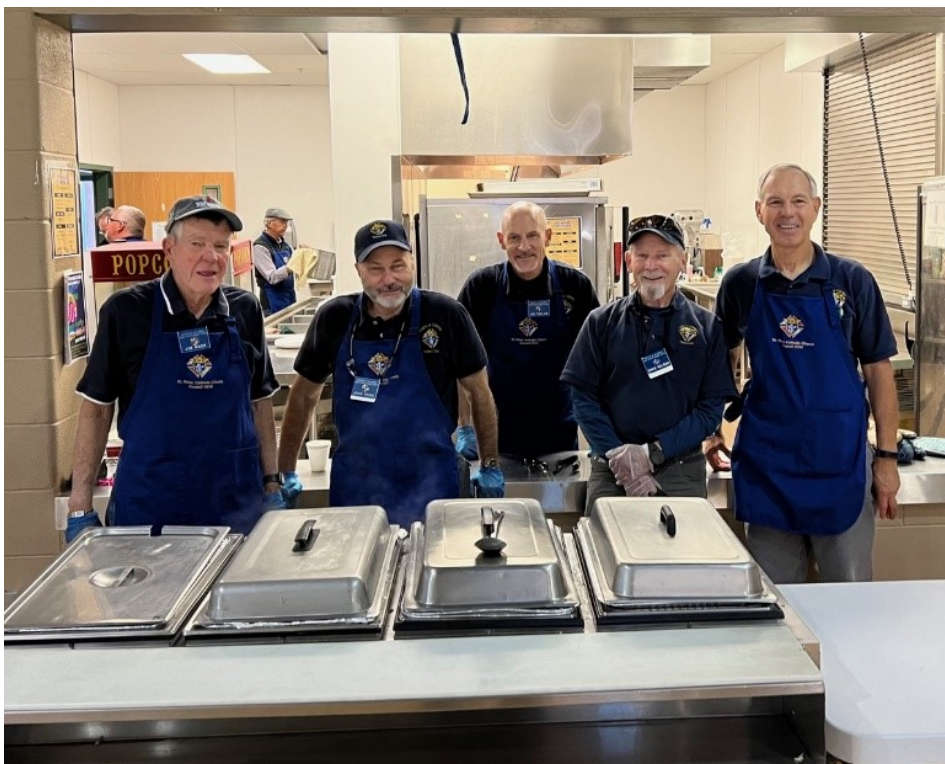
LEFT: Ready to serve up a tasty breakfast are