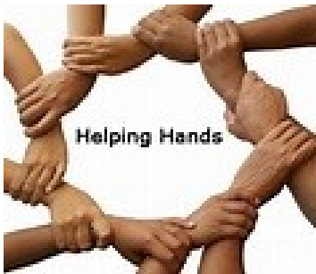
No Neighbor Left Behind