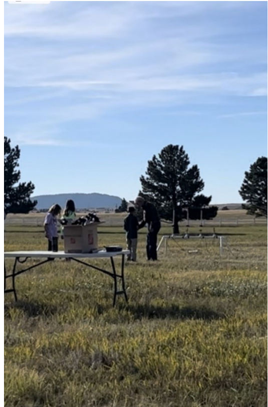
Preparing for launch; all systems go!