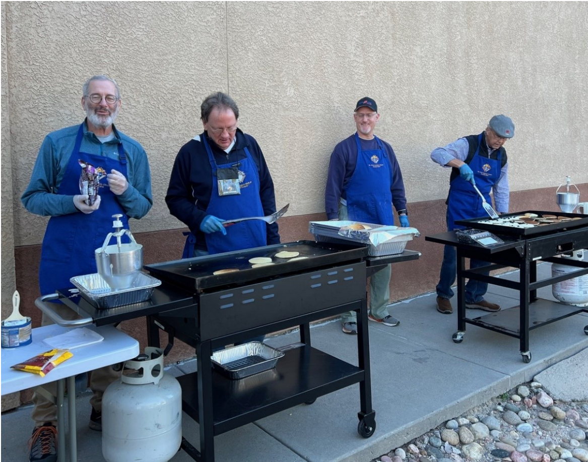
Expert chefs preparing pancakes, eggs and sausage for the Confirmation class breakfast.