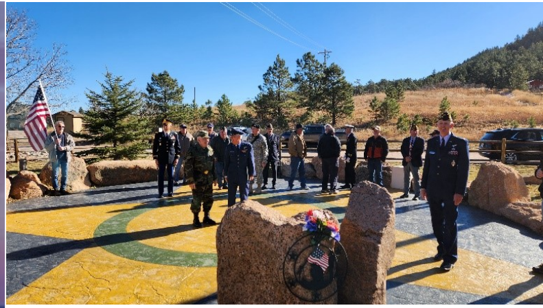
Veterans gather at the Crawford Memorial on Veterans Day.